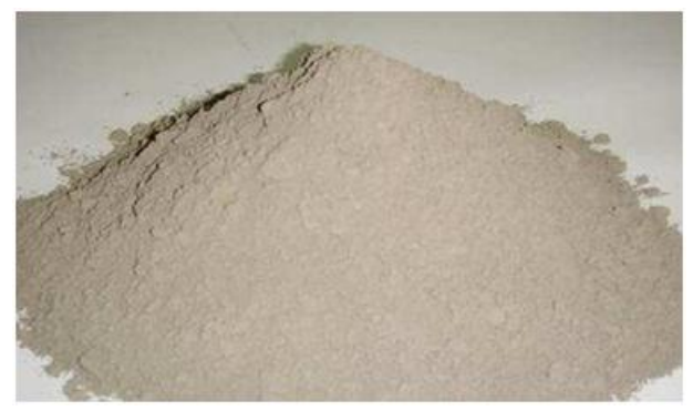
Fig 2. Ordinary Port Land cement

content, chemical and pollutants, resulting in the long-term integrity of structures.