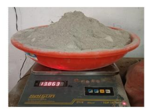
Fig 1.Fly Ash

Fly ash is a by product of coal combustion and is used as a partial replacement for Portland cement to reduce the energy required for cement production. This leads to fewer carbon emissions and less use of natural resources. Additionally, using fly ash in cement can improve the strength and durability of the final product, reducing the need for maintenance and repair. Thus, using fly ash in cement is a sustainable and environmentally friendly option.