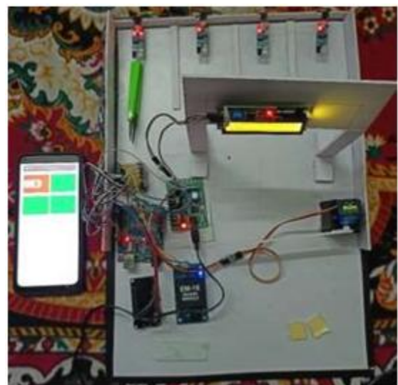
Fig 1.3 Final Output

Moreover, RFID-based smart parking management enhances security by ensuring that only authorized vehicles can access designated areas. This technology not only simplifies the parking experience for users but also contributes to overall urban mobility and resource optimization, making it a valuable solution for modern urban environments.