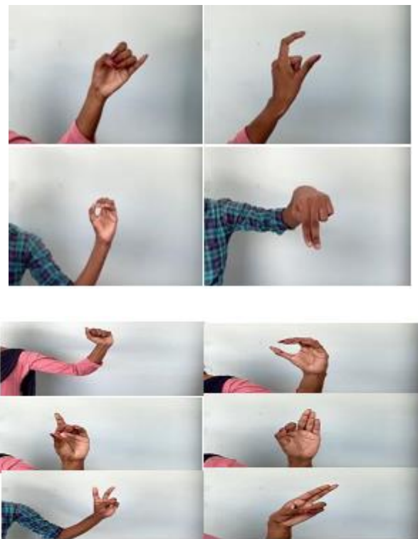
Fig.no. VI.1 Different Alphabet Signs