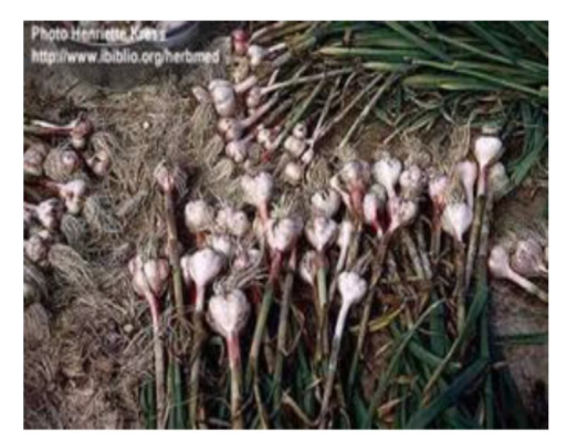
Fig. 3 Hard Neck Garlic

Taxonomists have recognized at least four botanical varieties within A sativum L. namely, A sativum L. var. sativum , A sativum L. var. ophioscorodon (Link) Doll, A sativum L. Var. pekinese (prokh) Maekawa, and A sativum L var. nipponicium Kitamura. Hard neck, soft neck and creole varieties of garlic are grown worldwide (Fig. 3 and 4). Hard neck varieties have fewer cloves and have little or no papery outer wrapper protecting the cloves. Soft neck varieties are white, papery skin and multiple cloves that are easily separated. There are two types of soft neck varieties artichoke and silver skin. Creole variety has eight to twelve cloves per bulb arranged in circular configuration. While the bulb wrappers are very white, the clove covers vary from a beautiful "red" rose color to dark purple.