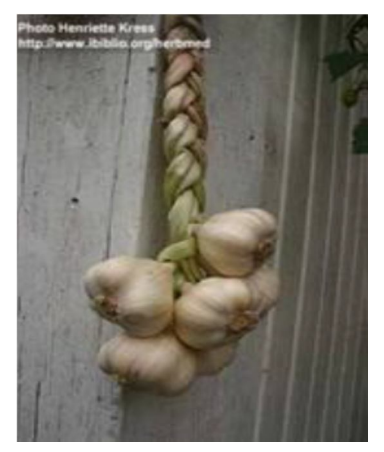
Fig. 4 Soft neck garlic