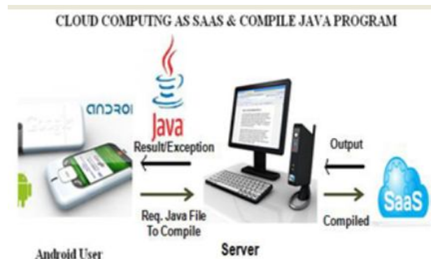
fig1. System Architecture