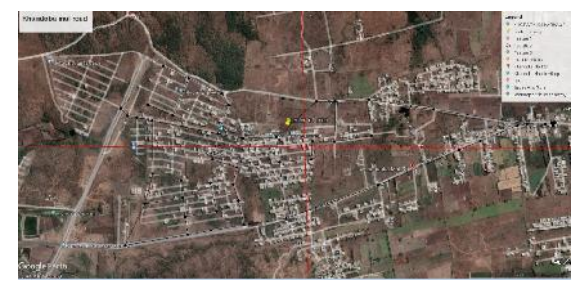
Fig.1.Khandoma Mal Road Area

The study area is opted in the surrounding of KHANDOBA MAL ROAD situated in LOHEGAON, which is at a distance of 6.3 km from Pune Airport