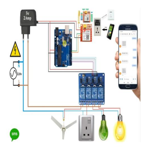
Fig -5 Block Diagram of GSM Based Home Automation

The general description of the system can be observed on block diagram below: