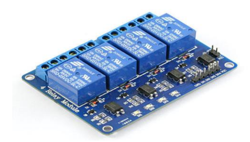
Fig 4: Channel Relay Module

The relay module for Arduino is one of the most powerful applications for Arduino as it can be used to control both A.C and D.C devices by simply controlling the relay by giving 5V. A relay is basically a switch which is operated electrically by an electromagnet. A relay can be used to control high voltage electronic devices such as motors as well as low voltage electronic devices such as a light bulb or a fan. We will be using the 4 relay Arduino module in our home automation project.