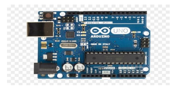
Fig 1: Arduino Uno R3

Arduino Uno R3 Arduino UNO is a microcontroller board grounded on the ATmega328P. It has 14 digital input/affair legs( of which 6 can be used as PWM labors), 6 analog inputs, a 16 MHz ceramic resonator, a USB connection, a power jack( 4). Arduino Uno can be powered through a USB connection or by an external power force, and the power source is named automatically. It can be operated at a voltage of 7V to 12V