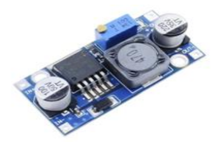
Fig 5: DC to DC Buck Converter

A buck converter or step-down converter is a DC-to-DC converter which steps down voltage (while stepping up current) from its input (supply) to its output (load). It is a class of switched-mode power supply. Switching converters (such as buck converters) provide much greater power efficiency as DC-to-DC converters than linear regulators, which are simpler circuits that lower voltages by dissipating power as heat, but do not step up output current.