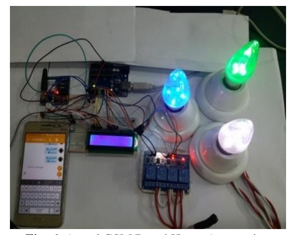
Fig -6. Actual GSM Based Home Automation