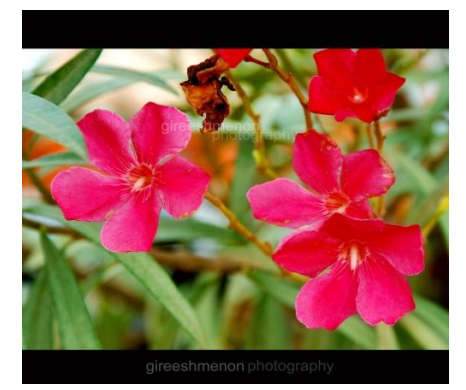
Fig. 1.1 Nerium oleander (Red)

In Turkish folk medicine, oleander flowers are used against rheumatic pain as a home remedy (Yesilda, 2002) [3]. The flowers are used against corns, warts, cancerous ulcers, carcinoma, ulcerating or hard tumours.