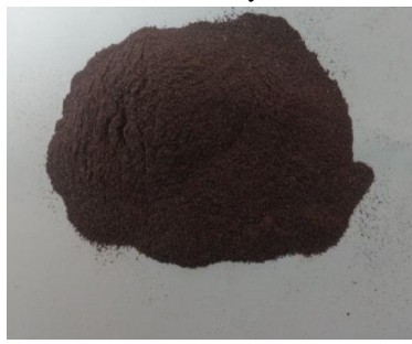
Nerium oleander (Red)

The fresh flowers were cleaned thoroughly and dried at 2-3 days in the sunlight under sterile conditions. The dried samples were made into fine coarse powder and stored in screw cap bottles until further analysis.