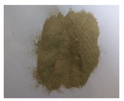
Nerium oleander (White)

Fig. 2.1 Powdered Oleander flowers samples