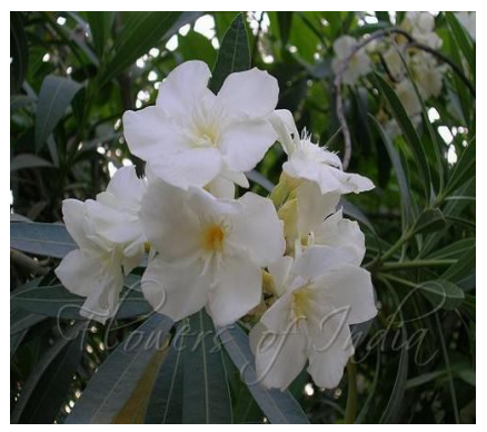
Fig. 1.2 Nerium oleander (White)