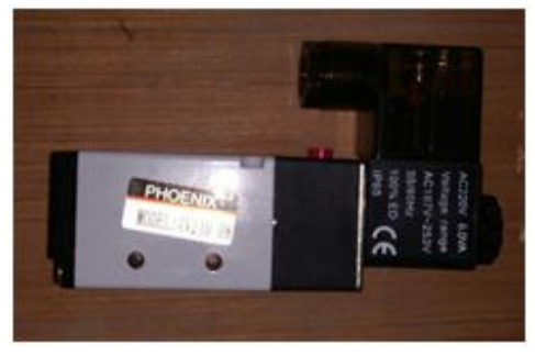
Fig :Solenoidal Valve

A solenoid valve is an electromechanical devices in which the solenoid uses an electric current to generate magnetic field and thereby operate a mechanism which regulates the opening of the fluid flow in a valve. The direction control valve is used to control the direction of air flow in the pneumatic system. The figure shows electrically controlled solenoid valve.