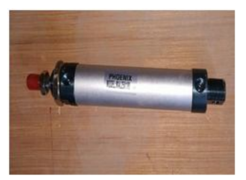
Fig : Pneumatic cylinder ( Double Acting)

pressure of air. The cylinder top and lower plate are flanged together by means of bolts and nuts. The bottom of the cylinder is also flanged with end covers for the movement of the piston in reciprocating manner.