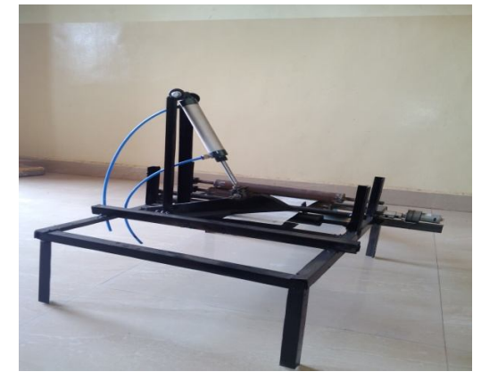
Fig : Actual Design of Frame

The shearing blade is made up of high speed steel material. The blade has to withstand the high cutting forces and this can be achieved by using high speed steel as a blade material. High speed steel offers reliable toughness and it retains good wear resistance. A typical composition is: 18% of tungsten, 4% of chromium, 1% of vanadium, 0.7% of carbon and the rest is iron.