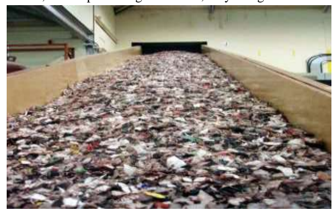
Fig.No. 3. Mixing of shredded waste plastic.

3. Mixing of shredded waste plastic, aggregate and bitumen in central mixing plant: Plastic materials. Due to its structure, components and characteristics, plastic is a very unique material that is mainly used in industrial production. The plastic waste can be recycled by shredding and washing the material, before producing a reusable, recycled granulate.