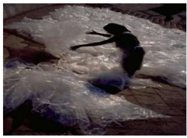
Fig. No.1 Collection of plastic waste

1. Collection of plastic waste:Plastic waste collected from various sources must be separated from other waste. Thickness of plastic is 60 microns or more.