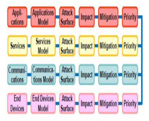
Figure 2: SWSDF framework

At that point we distinguish the relief components that can be executed to reduce these assaults lastly we organize the administration as indicated by the potential effect to the framework. By following this design, we can guarantee the advancement of profoundly secure and reliable SWS administrations. In what tails, we depict the assault surface, affect, and moderation and need planes for each layer in our SWSDF system.