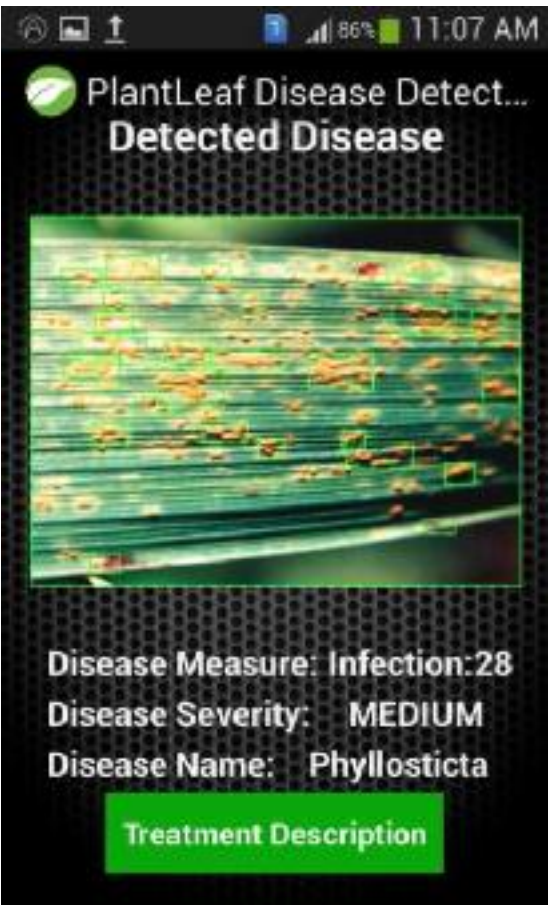
Fig 2:The Result of after Detecting Disease Description.

The under table shows the credit rate From the above conducted examination the table clearly shows that the performance of neural network is not only depending ahead the number features, number of unseen neurons and the loss mistake rate but also depends on the quality of trial picture. Therefore an optimization have to beinnocent with number of characteristic values, number of concealed neurons and the killing error rate in various dissimilar input conditions in order to properly classify sample to their equivalent module.