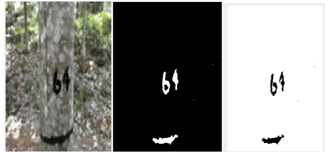
Fig 2. Original image, binary image, tree number 64

After undergoing certain processes the results obtained are shown below. During the segmentation process, the most successful segmentation method was contour filtering. Even though customized Grab cut function and color based segmentation provided reasonably better results, the accuracy levels were below the required levels especially for width measurement. Figure 2 Color Based Segmentation results.