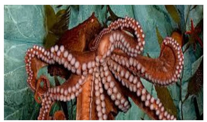
Fig: A photograph of a Octopus

The arms of octopuses are often distinguished from the feeding tentacles found in squid and cuttlefish. These bacteria can be grown on specially designed media such as BOSS medium, NaCl complete medium.