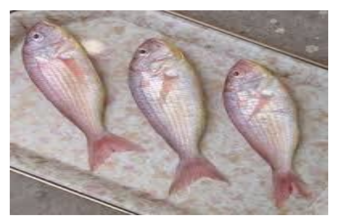
Fig: A photograph of a Raja-Rani

collected its scales and inoculated into BOSS broth but this time is not used controlled temperature for incubation we kept it on shaker incubator at room temperature.