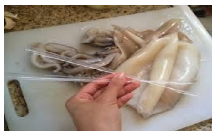
Fig: Ink sac of squid

We got a sample from a region 'ambolighat'. It was a wooden stick. When observed it in dark, it showed luminescence. It has some growth on its surface which was showing luminescence. We scrape the glowing part from stick and transferred it to BOSS medium. We incubated it in shaker incubator at 27°C for 24 hrs.