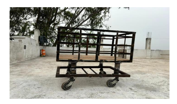
Specification of Trolley

We have designed the trolley in such a manner that it is dimensioned with 3*2*1.5 feet with a weight carrying capacity of 150 kilograms, four springs of equal strength,diameter, no of turns and outer diameter is used in between trolley tank and wheel chassis. Four wheels of equal diameter are connected to wheel alignment which is flexible to the transportation facility.